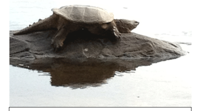
Large Turtle basking in the bay of Bay Lake